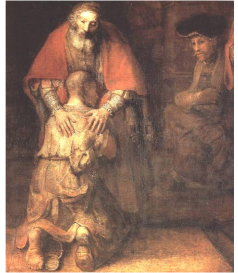
Image: The Return of the Prodigal Son by Rembrandt

March 22 nd –Forgiveness, Reconciliation and Redemption